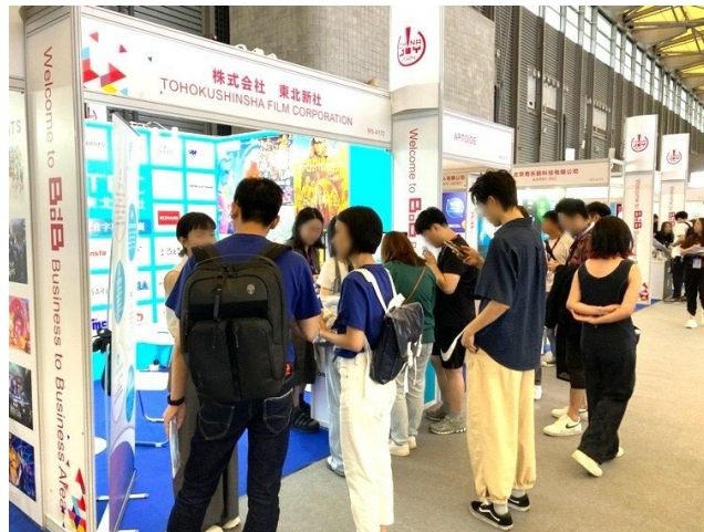
TFC's booth at ChinaJoy 2024 welcomed many visitors and generated strong interest.